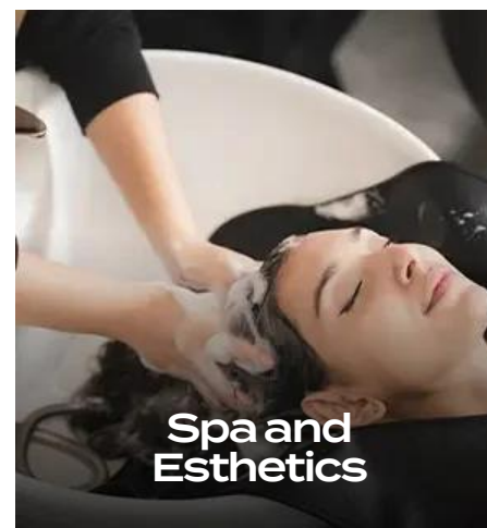
Spa and Esthetics