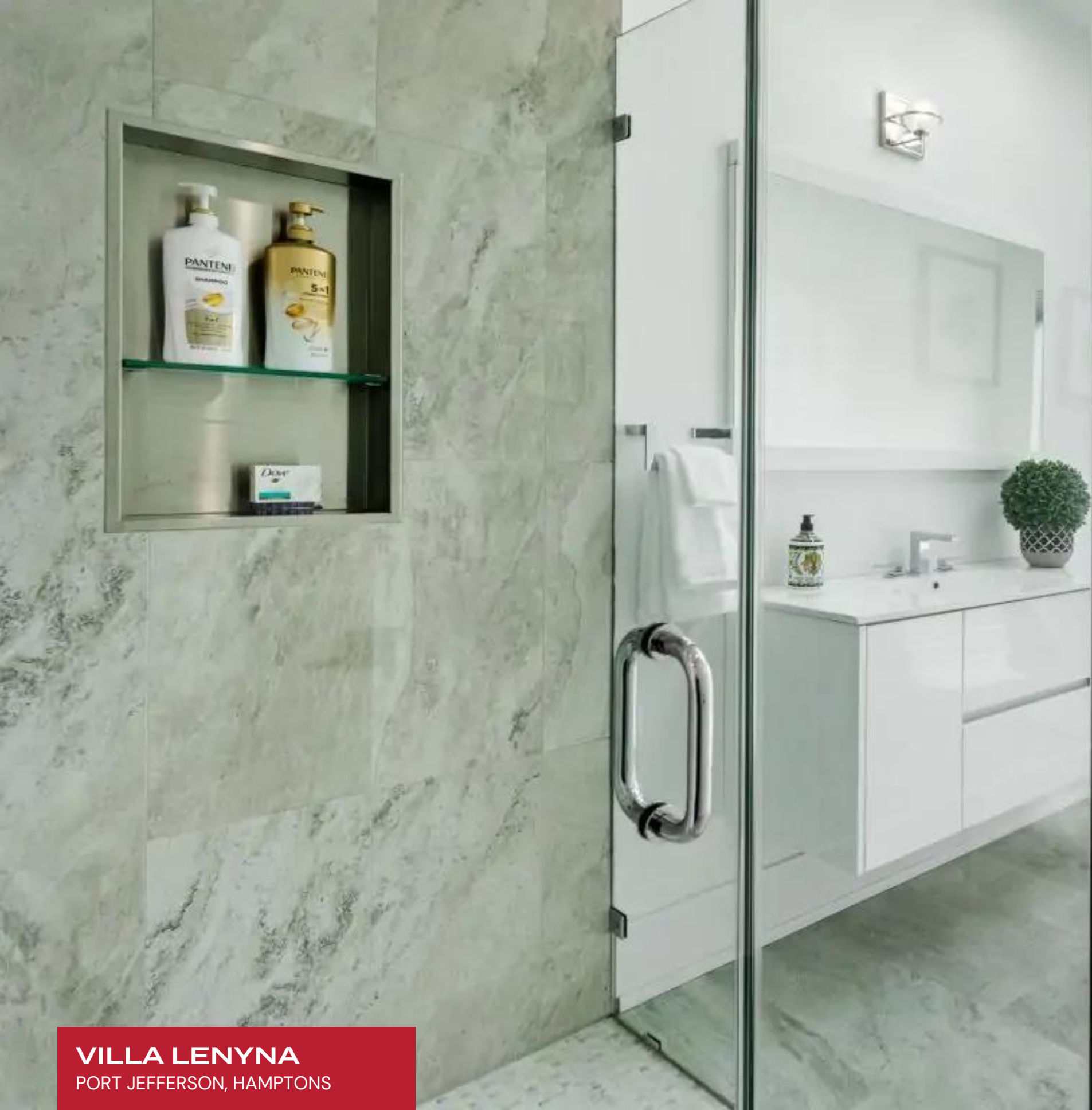
VILLA LENYNA PORT JEFFERSON, HAMPTONS