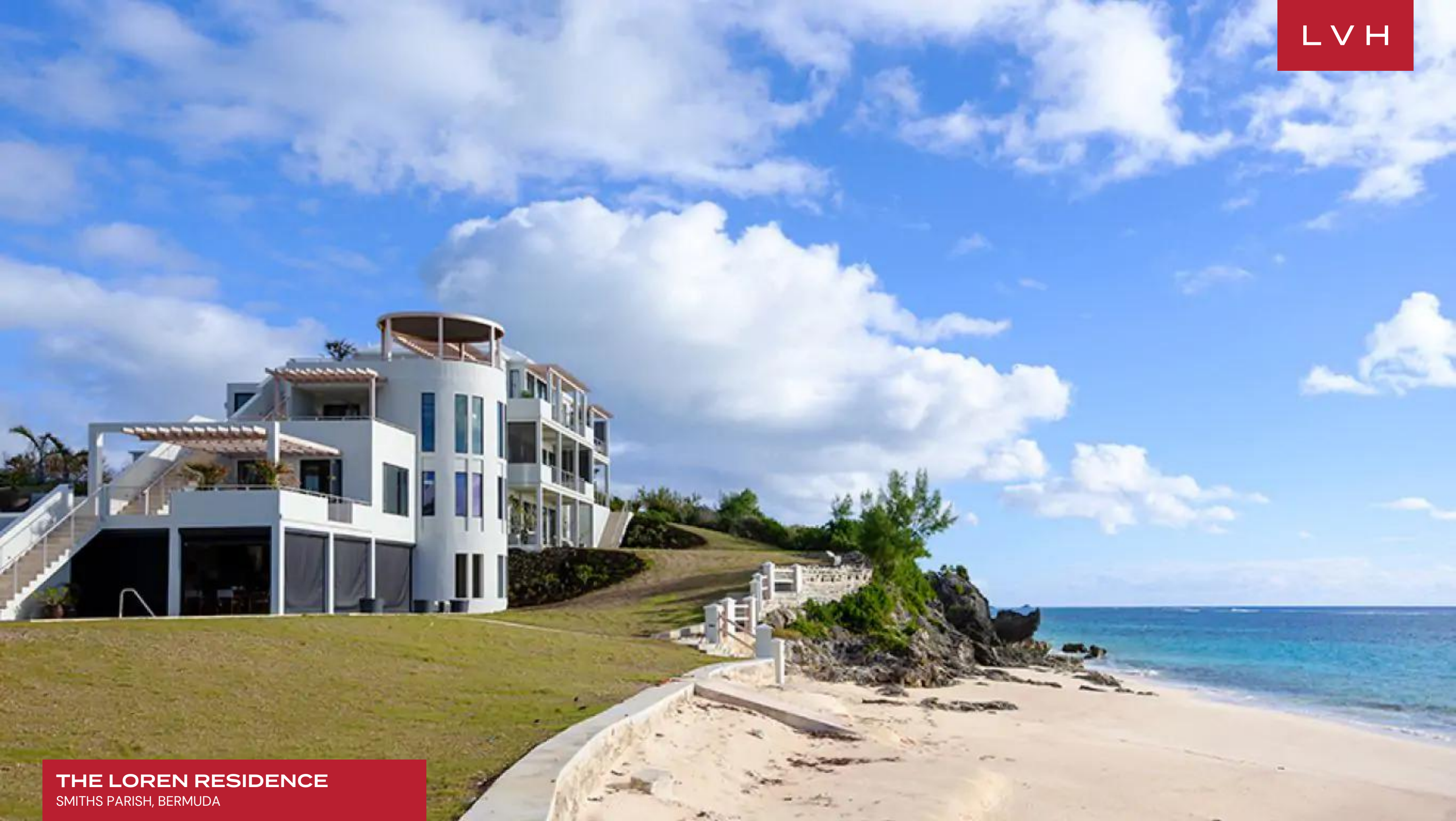
THE LOREN RESIDENCE SMITHS PARISH, BERMUDA