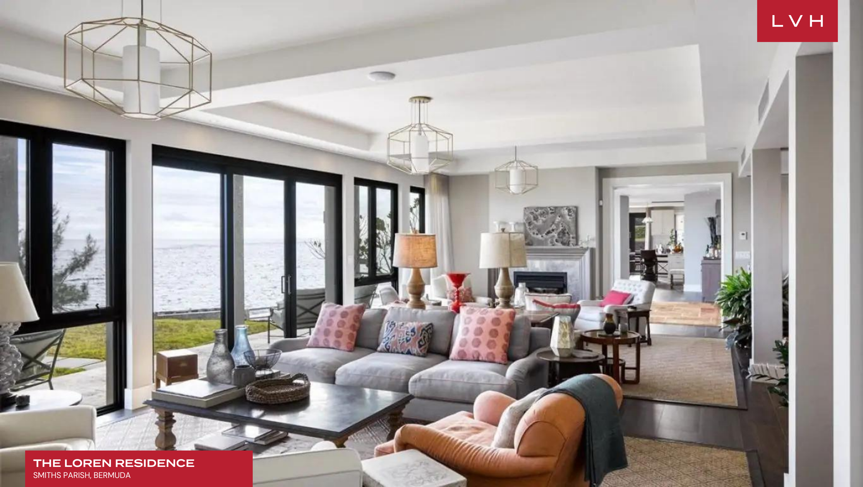
THE LOREN RESIDENCE SMITHS PARISH, BERMUDA